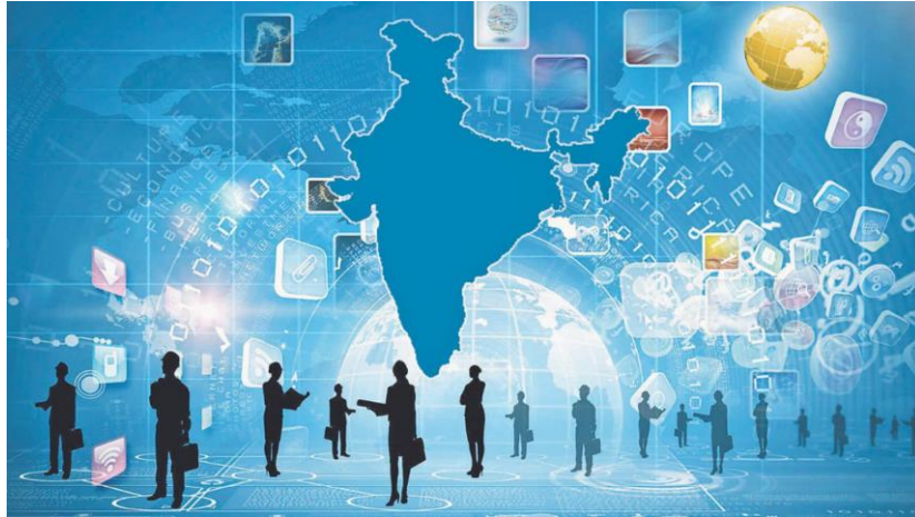
Figure 2. About India's Transformation

Totally we can say that, in this methodology new steps are taken to explain the concept of transformation in India.