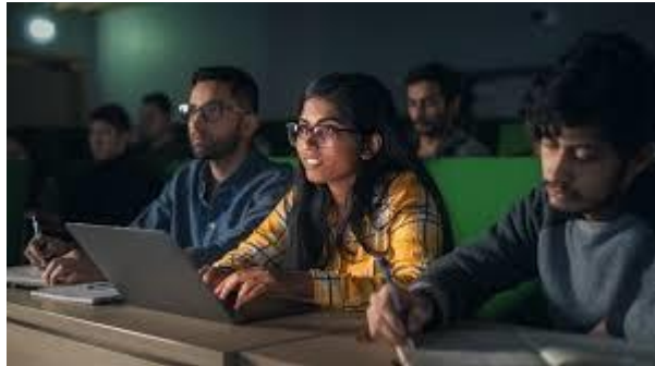
Figure 1. About the World of Work

In this methodology, we can say that, there are a number of strategies were used as a methodology. In this methodology, just we are checking, how India accepted transformation and how it influences the world also.